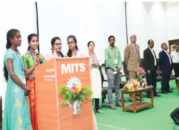
Invocation Song by Senior Students