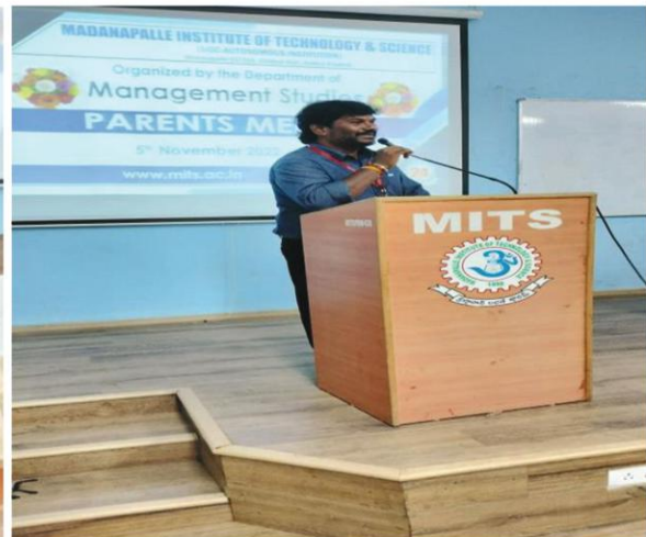
Placement officer addressing Parents