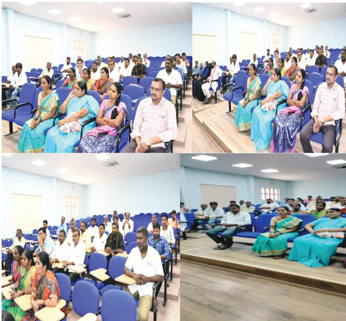
Parents Meet on 5 th November 2022