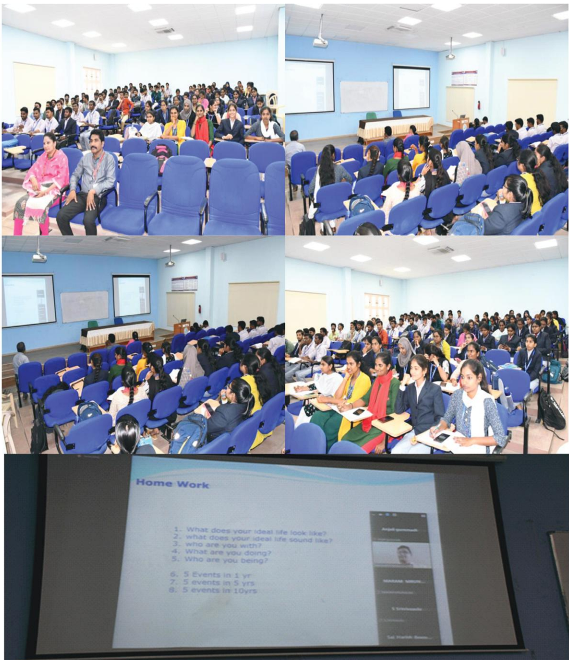
Faculty and Students of MBA attending Live Webinar