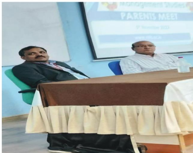
Vice Principal and MBA HoD during Parents Meet