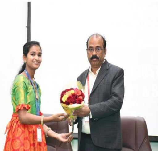
Welcoming a Principal with Bouque