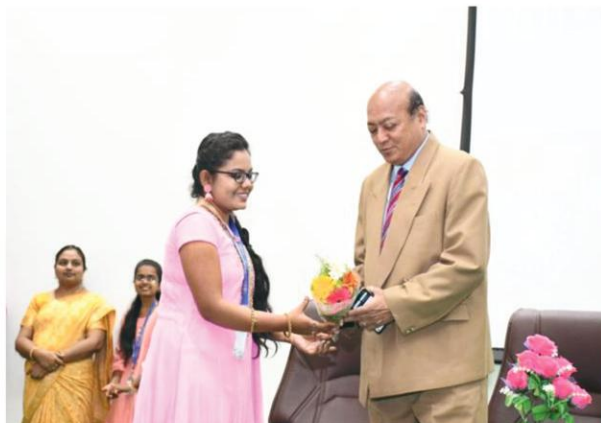
Welcoming MBA HoD with Bouque.