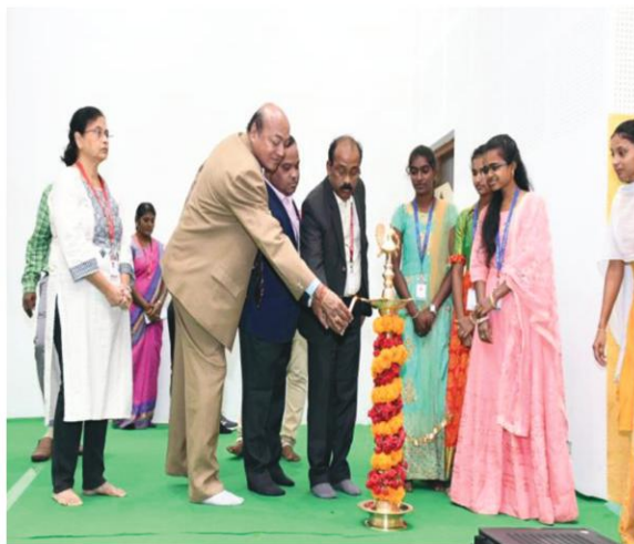
Lighting ceremony of the Orientation Program