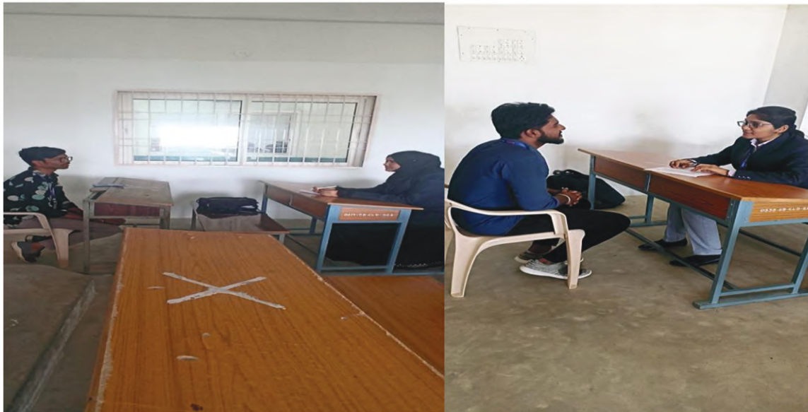
MBA 1st Year students conducting mock interviews for BTech students