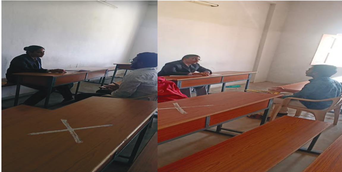
MBA 1st Year students conducting mock interviews for B.Tech students

Our MBA 1 st Year students conducting mock interviews for BTech students during the period from October to December 2022.