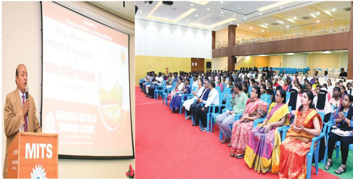
MBA HoD addressing the MBA Freshers

MBA 1 st Year Induction Program from 03/11/2022 to 12/11/22