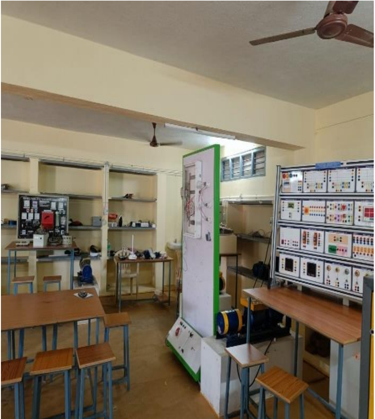
View of Electrical Home Lab