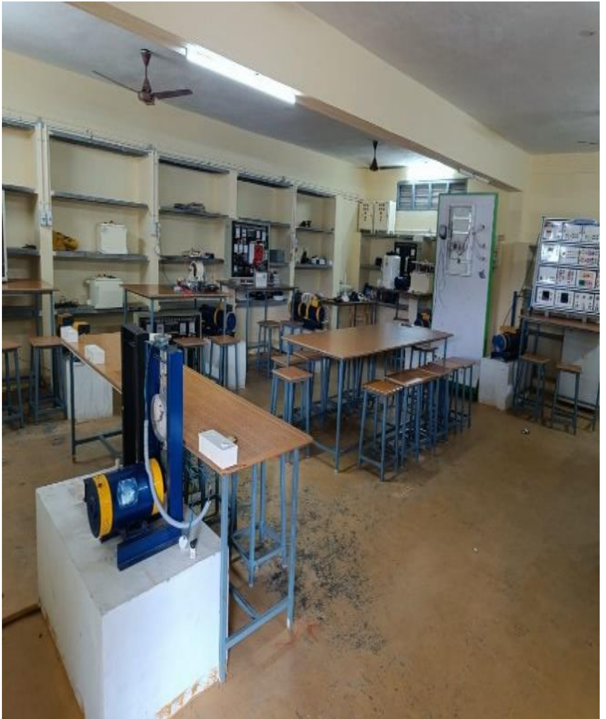
View of Electrical Home Lab

Madanapalle-517325, Annamayya Dist., Andhra Pradesh