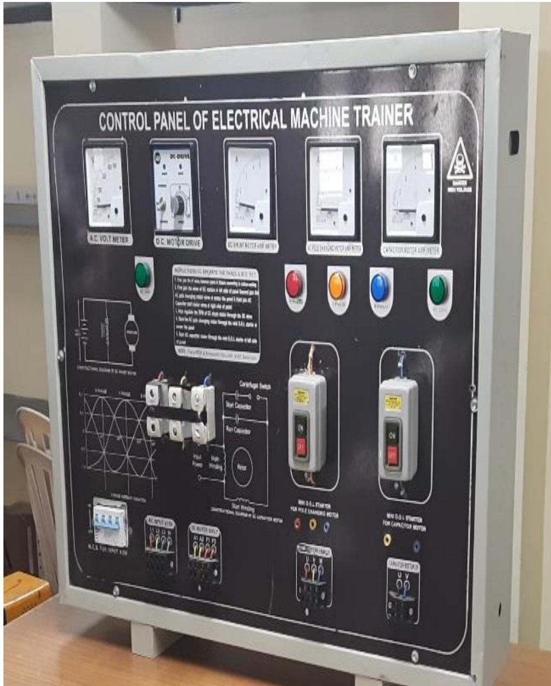
Control Panel of Electrical Machines Trainer Module

TECHNICAL SKILL DEVELOPMENT INSTITUTE (t-SDI)